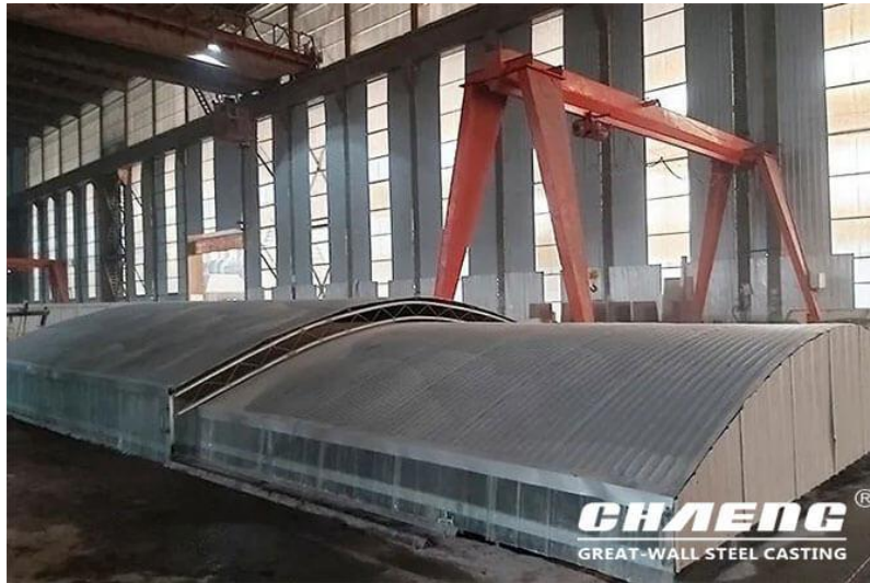
Fully enclosed molding quartz sand storage area