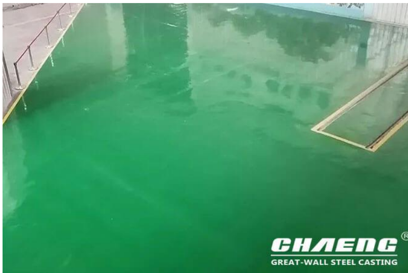
Epoxy floor in the workshop