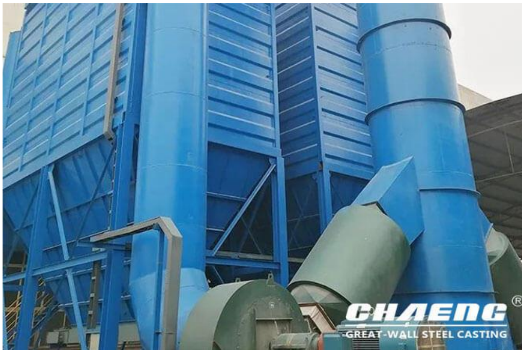
Large bag dust collector

As a large-scale foundry base in the northern part of Henan Province, CHAENG has been positioned as a “high-end foundry” enterprise development concept since the beginning of the plant. During the actual production development process, it has continuously innovated and upgraded casting technology to achieve green casting and effectively promote the company. Both production development and environmental protection are favorable. As an excellent environmental protection enterprise in the foundry industry, CHAENG’s environmental protection and economic development have gone hand in hand