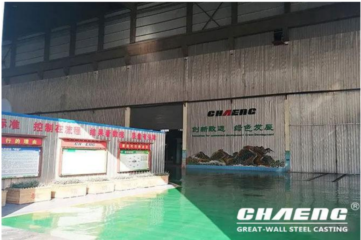
Closed isolation of each process in the workshop

Following the trend of green development of the industry, CHAENG actively explores all aspects of foundry technology, workshop equipment, etc., divides and isolates each functional area of the workshop, introduces environmental protection equipment, and improves production processes, etc. CHAENG has formulated and implemented a series of effective environmental protection measures.