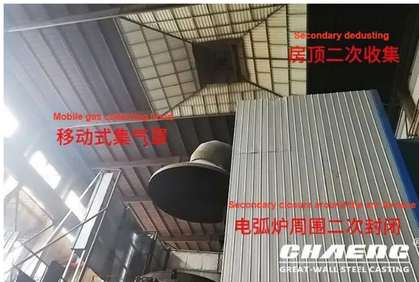
Environmental protection facilities in production workshop