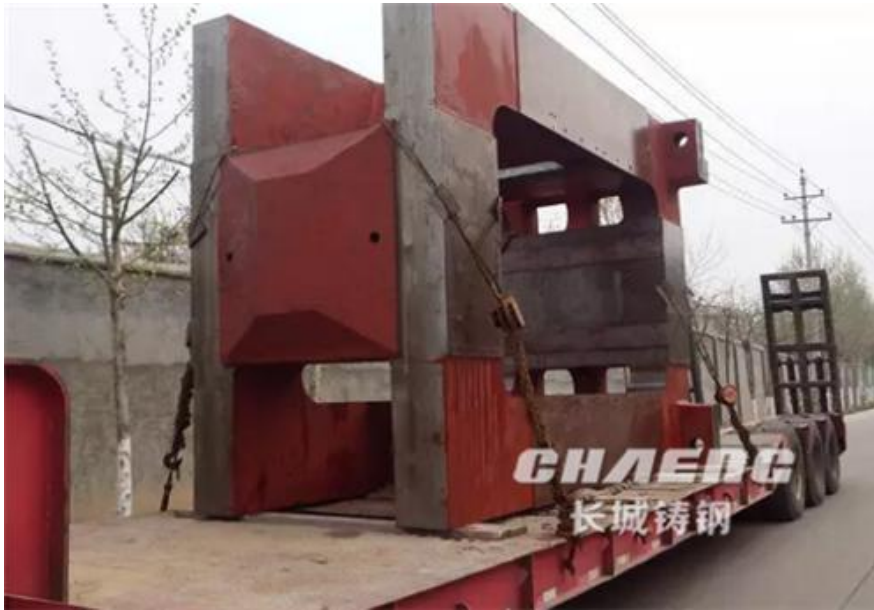
Rolling mill housing

The rolling mill is a device that realizes the metal rolling process. Its working environment is harsh, the main components are susceptible to corrosion and wear, and the technical and quality requirements of the components are high. CHAENG (Great Wall Steel Casting) focuses on the production of large-scale steel castings for more than 10 years, and can cast and process high-quality rolling mill accessories for customers according to customers' drawings and needs.