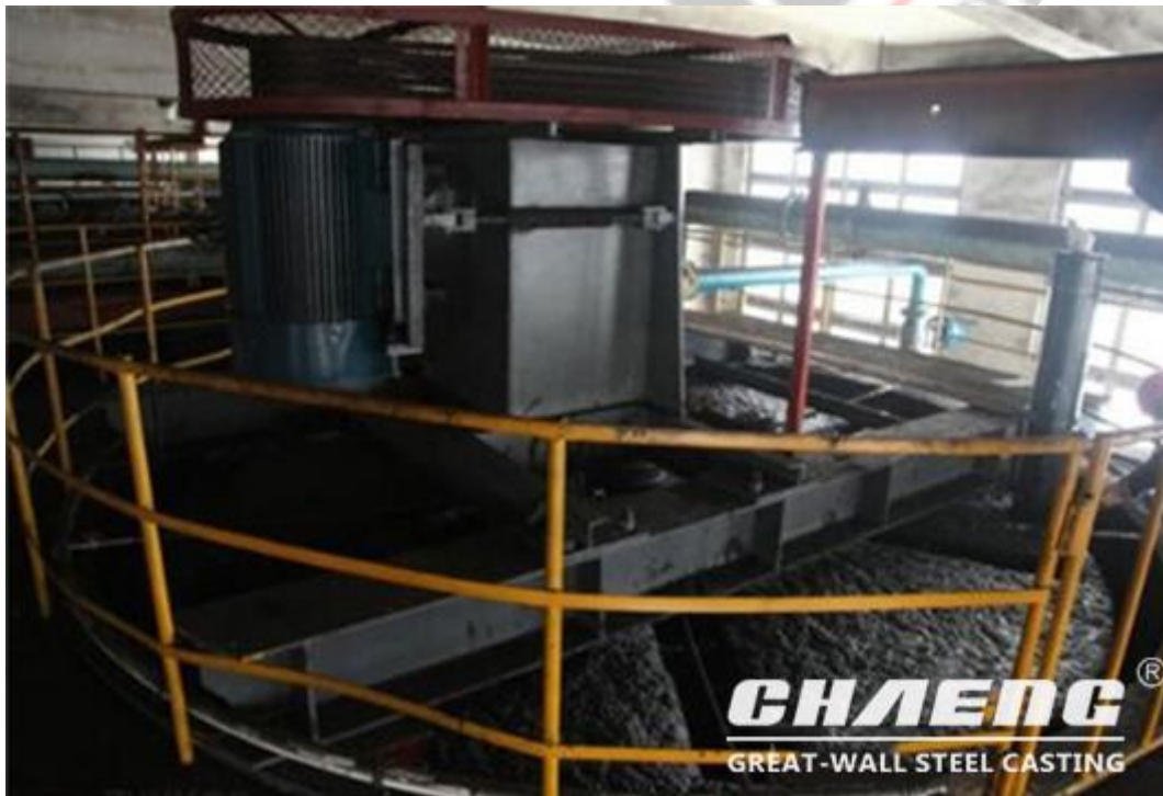
Fig. One Zhejiang ceramic manufacturer purchased CHENG ceramic press column

One Zhejiang ceramic manufacturer repeatedly stressed the reliability of the column during looking for ceramic press column suppliers. CHAENG optimized press column casting process to meet the customer's processing needs very well.